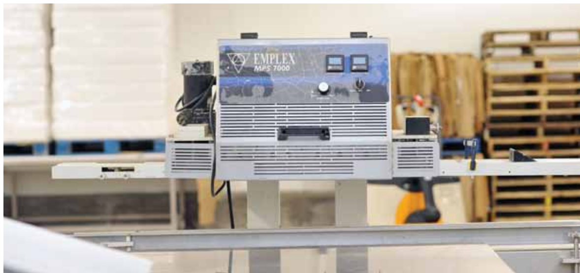
An Emplex bag sealer is to seal up pouches of various-sized chicken cuts.