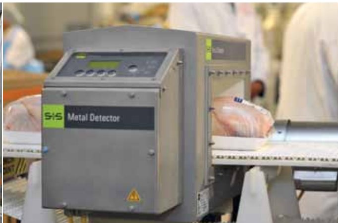
Every product packaged at the plant is conveyed past a S+S metal detection system to ensure product integrity.