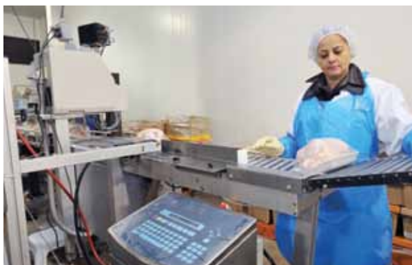
Trays of product move past a Markem-Imaje inkjet coder to have lot data and product codes applied.