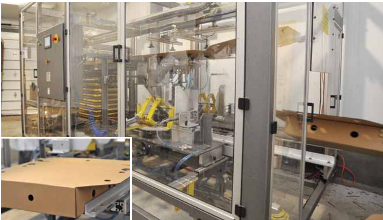
The recently-installed POPLOK tray-erector from Eagle Packaging Group enables the plant's secondary packaging operations to handle an average of 10 cartons per minute using the new one-piece, die-cut corrugated cartons (inset) supplied by Atlantic Packaging Products.