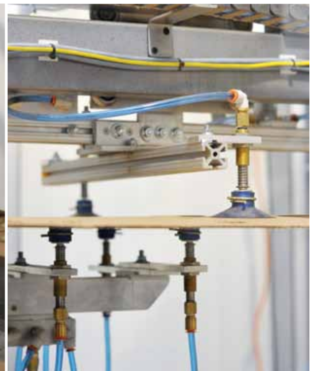
A close-up view of pneumatic components incorporated inside the POPLOCK tray erector to enable quick and gentle handling of the cartons' flaps.