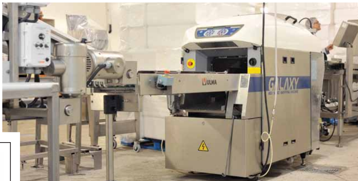
A recently-purchased ULMA Galaxy high-speed wrapping machine awaits its turn on the second production line currently being installed at the Perfect Poultry plant.