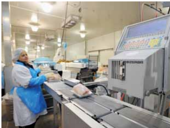
A Perfect Poultry plant employee monitors a Bizerba weigher installed on the facility's production line.