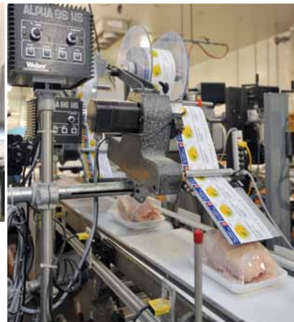
An Alpha 86 HS labeler, from Weber ensures quick and precise label placement onto the passing packages.