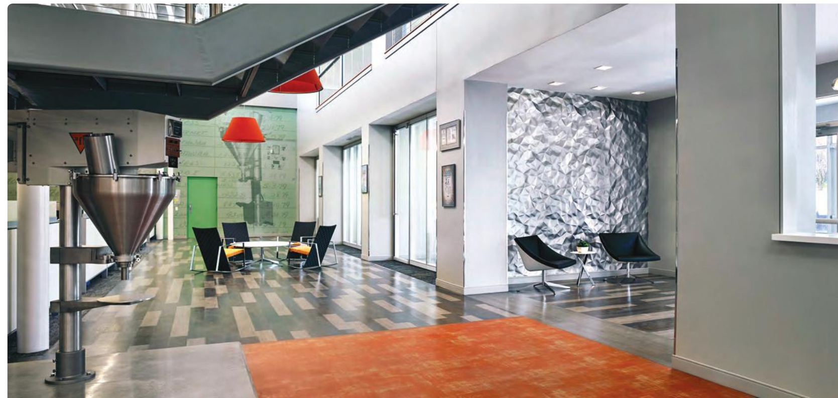
BluePrint Automation shifted its office structure from closed offices and cubicles to an open floor plan with adjustable desks for sitting and standing.

After the renovation and expansion, All-Fill's Exton, Pa., office now sits at 65,000 sq. ft. The renovation cost the filling, bagging and checkweighing equip-