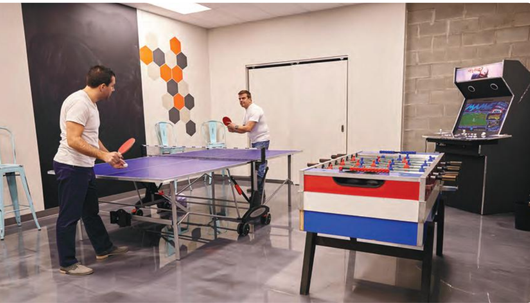
WeighPack employees play ping pong during a break in the OEM's new social room.

ment manufacturer about $2.8 million, and the OEM was able to stay within budget while including all the bells and whistles they had on their wish list.